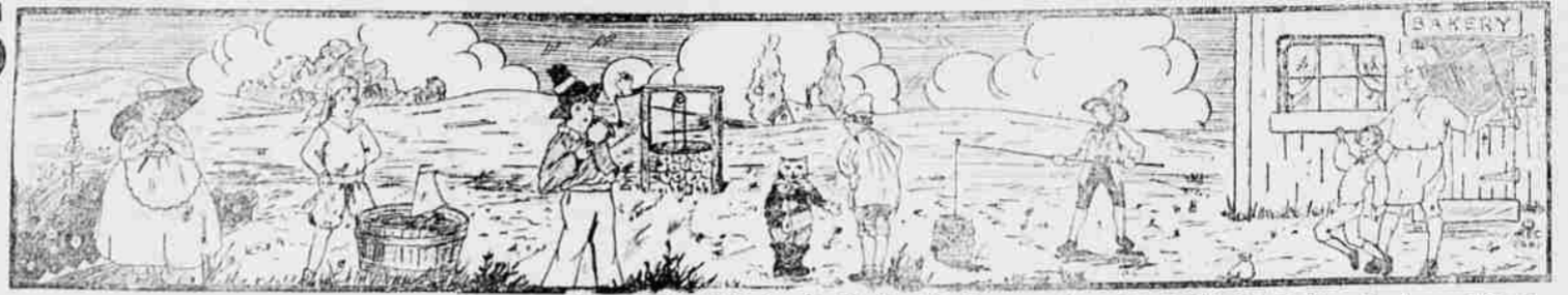
Copyright 1929, by R. E. Corbit Corporation, N. 115 1/2 Wall St., Spokane, Wash.

To be given each week to the boys and girls of the La Grande Evening Observer family. You can earn some money each week by writing prize winning endings for the jingles below. This page will appear each Wednesday. Prize winners will be announced next Wednesday.