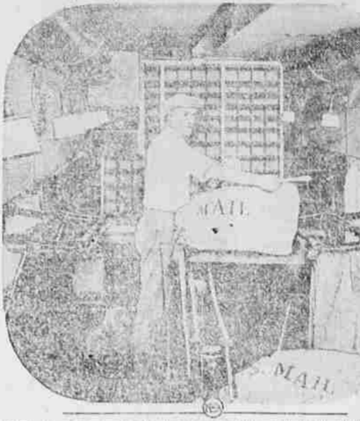
This is how Uncle Sam's flying postoffice will look when clerks are carried on planes to sort airmail while the plane is en route. The Boeing Air Transport, operators of the San Francisco-Chicago route, is building a fleet of 15 passenger planes which can be converted into mail planes like this within 24 hours. The mail cabin is 15 1/2 feet long, five and one-half feet wide, and allows a clerk to stand upright while working. There is room for 200,000 letters.