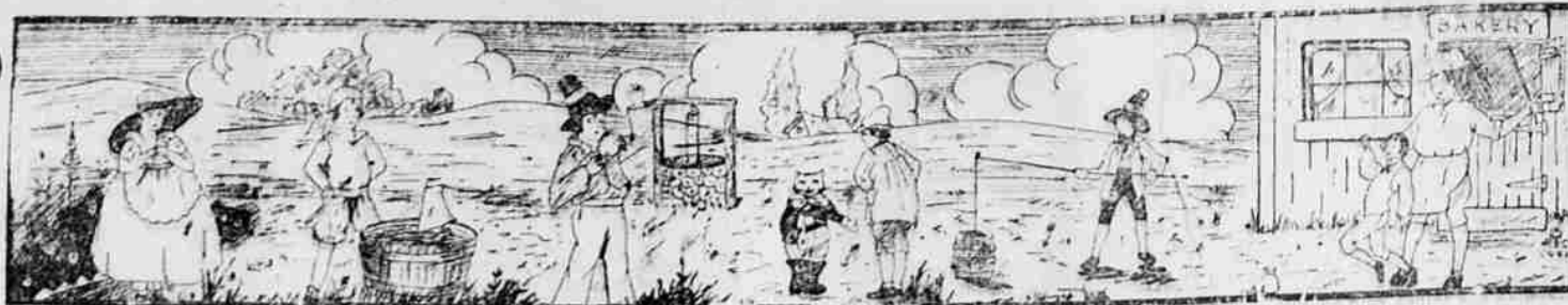
Copyright 1929, by R. E. Corbit Corporation, N. 115 1/2 Wall St., Spokane, Wash.

To be given each week to the boys and girls of the La Grande Evening Observer family. You can earn some money each week by writing prize winning endings for the jingles below. This page will appear each Wednesday. Prize winners will be announced next Wednesday.