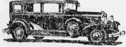
THE NEW '77' CROWN SEDAN, $1775 (Special Equipment Extra)

MULTI-RANGE GEAR SHIFT ELIMINATES ALL POSSIBILITY OF COMPARING CHRYSLER PERFORMANCE WITH OTHER PERFORMANCE. A DEMONSTRATION SPEEDILY PROVES THIS TO YOU.