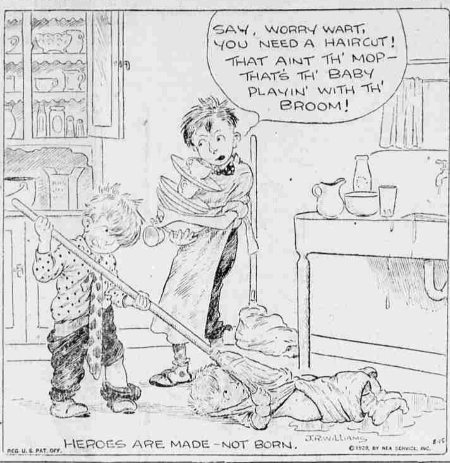
HEROES ARE MADE—NOT BORN. © 1929, BY NEA SERVICE, INC.