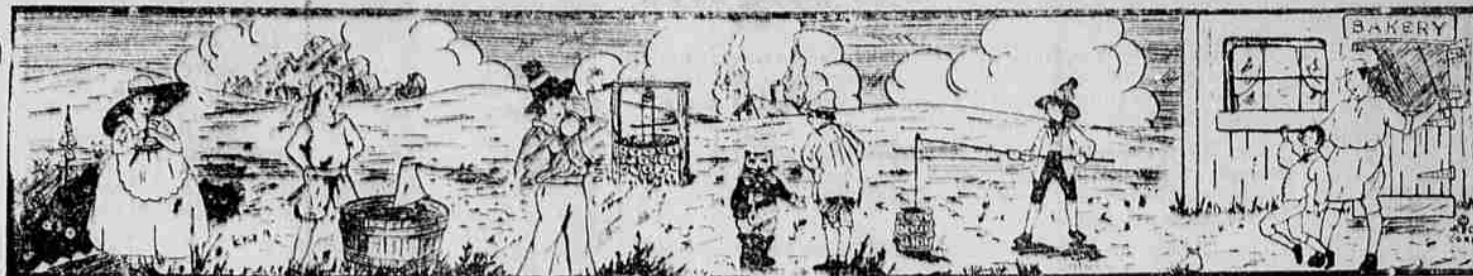
Copyright 1929, by R. E. Corbit Corporation, N. 115 1/2 Wall St., Spokane, Wash.

To be given each week to the boys and girls of the La Grande Evening Observer family. You can earn some money each week by writing prize winning endings for the jingles below. This page will appear each Wednesday. Prize winners will be announced next Wednesday.