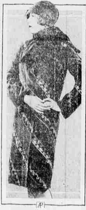
A rich wine shade of red, with a diagonal lavender stripe, in the material of this early fall coat. The hat is of the same deep red tone. The neck finish of the coat is black broadtail.