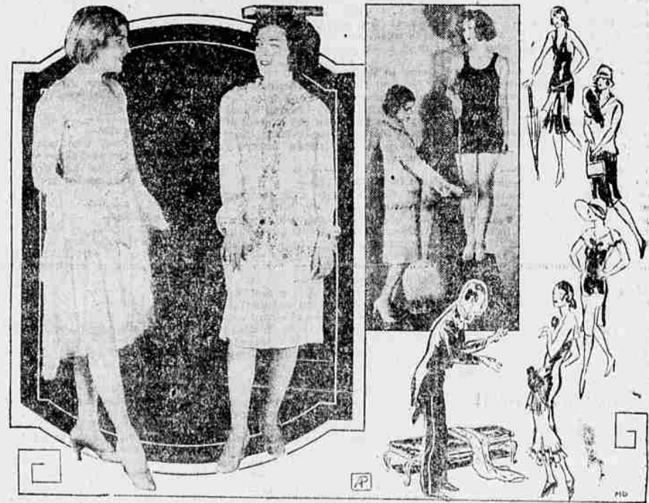
A Chicago "charm school" teaches grace in walking by having students walk with books on their heads (left). In the other picture the proper length of skirt is being determined.