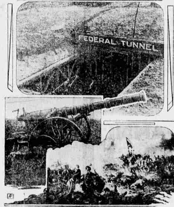
Improved roads will make accessible new scenes of the battle of the Crater near Petersburg, Va., including the entrance to a federal tunnel and one of the early "repeating cannons." Below is a reproduction of a painting depicting the historic battle.