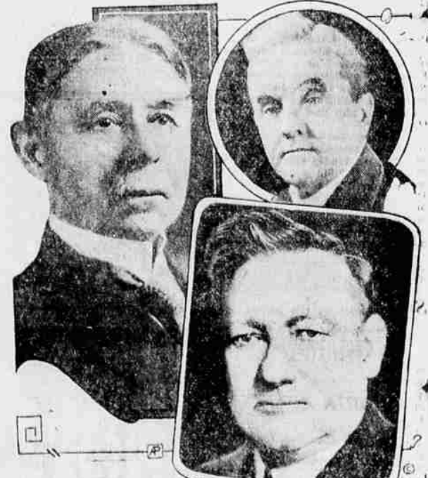
Senator Simmons (left), Democrat, Senator Watson (lower right), Republican "regular," and Senator Norris (upper right), Republican Independent, will be in the forefront of leadership in the tariff fight in the senate when that body reconvenes August 13.