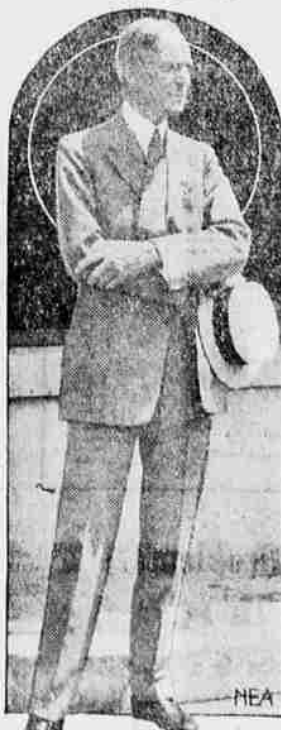
Here's Henry Ford, as he looked on his 66th birthday. The Detroit automobile manufacturer worked as usual, taking "time out" during lunch for cameramen to snap a few pictures of him.