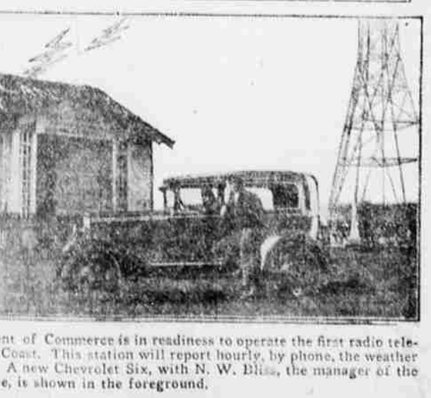
The United States Department of Commerce is in readiness to operate the first radio telephone station on the Pacific Coast. This station will report hourly, by phone, the weather conditions to planes in flight.