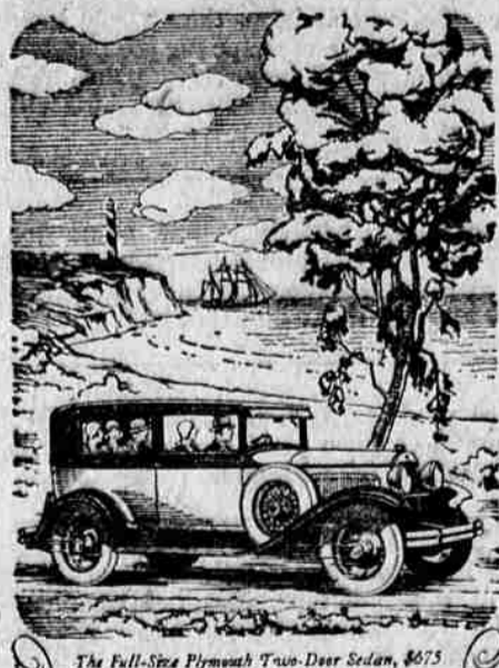
The Full-Size Plymouth Two-Door Sedan, $675

Another FINE FEATURE... Plymouth has Over-Size Tires