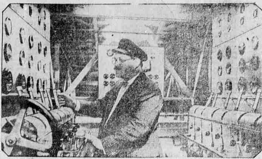
The pilots may fly it, but the chief engineer has a lot to think about on the new 100-passenger German airplane that has been successfully tested in flights over Lake Constance, Switzerland—and if you don't believe it, look at this. The control room on the great 12-motored plane is pictured here, and it looks like the chief engineer has a right busy time with the multitude of wheels, gears, indicators and levers. Observe the sturdy steel construction of the big plane's interior.