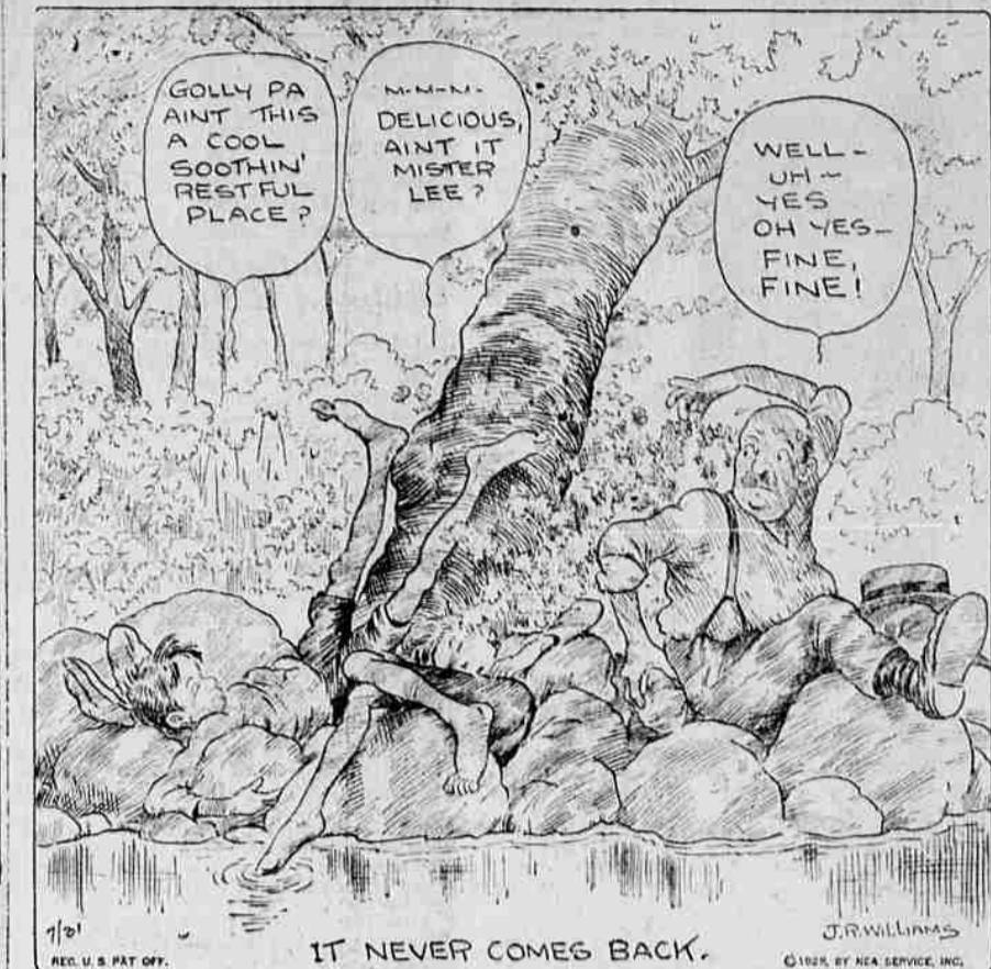
REG. U. S. PAT. OFF.