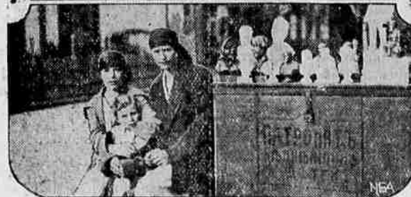
The city of Harbin, Manchuria—half Chinese and half Russian in population—is one of the points on the Chinese Eastern railway where China and Russia are most at odds. These exclusive photos show scenes in the city. In the center is a street in Fuchien, the Chinese section of Harbin. Below are two Russian women street merchants in the Russian quarter.