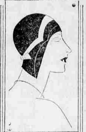
A TWO-PIECE felt hat held together with a slide fastening diagonally across the top is one of the clever new imports.

Methods of control and treatment for anaplastosis, a cattle disease similar to Texas fever, are sought by Texas and federal entomologists.