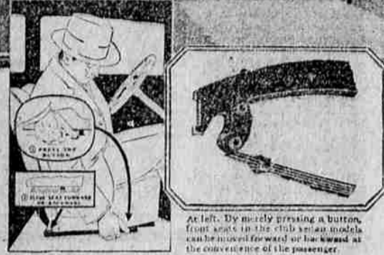
At left, by merely pressing a button, front seats in the club seat models can be moved forward or backward at the convenience of the passenger.

With the introduction of new Dictator Six models listing from $995 to $1195 at the factory, Studebaker adds a companion car for the new Dictator Eight. The Dictator Six Coupe offered at $995 carries the lowest price of any Studebaker closed car in history. The Royal Sedan, illustrated above, carries six wire wheels and trunk rack as standard equipment. The fore-shock front spring of the new Dictator, giving greater steering stability, is shown at left.