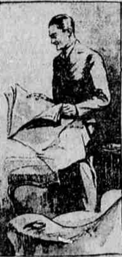
The News of the Day --