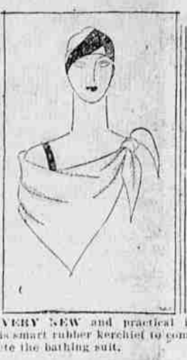
VERY NEW and practical is this smart rubber kerchief to complete the bathing suit.