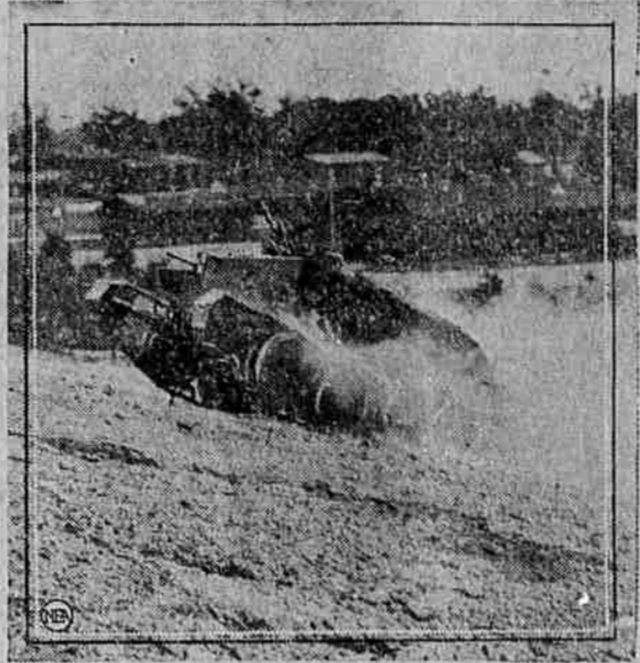
Here you see the world's speediest "caterpillar" in action. It is a new three man armored combat tank, fastest and most effective "crawling" up a hill in a ploughed field at the heretofore unheard of speed of 42 miles per hour in a successful demonstration before government officials at Fort Meade, Md. The tank, which can be converted into a caterpillar machine for use on highways in 14 minutes, attained a high speed of 62 miles per hour on its road tests.