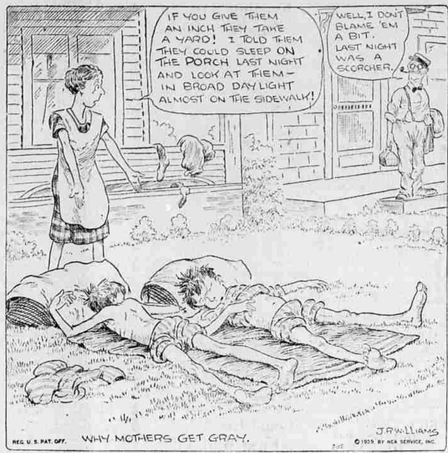
WHY MOTHERS GET GRAY. REG. U. S. PAT. OFF. © 1929 BY NEA SERVICE, INC.