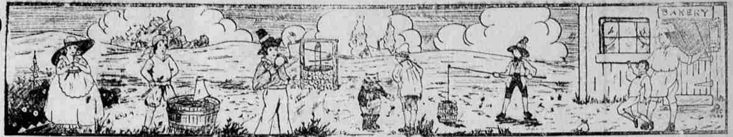
Copyright 1929, by R. E. Corbit Corporation, N. 115 1/2 Wall St., Spokane, Wash.

To be given each week to the boys and girls of the La Grande Evening Observer family. You can earn some money each week by writing prize winning endings for the jingles below. This page will appear each Wednesday. Prize winners will be announced next Wednesday.