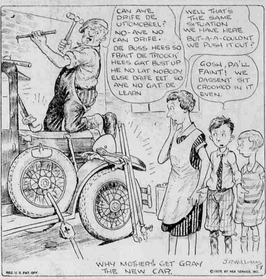
WHY MOTHERS GET GRAY THE NEW CAR.