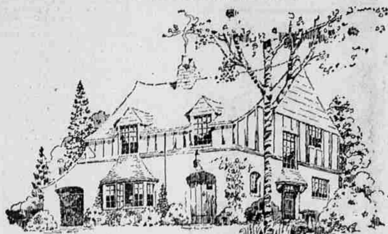
By Chester H. Disque

The above plan shows a very practical and convenient layout that lends itself to an easy solution to the problem of interior decoration, making an attractive appearance with a minimum amount of expense. The bay window, fireplace, staircase and built-in shelves between the living and dining room provide an interesting feature that may be seen from most any part of the first floor or living porch. The entrance to the kitchen and bathroom is very convenient and direct, both from the house or side yard, but at the same time does not interfere in any way with the living quarters. The kitchen sink is flanked on each side by attractive work tables with china cases above. The breakfast nook, table and bench are so placed as to allow a view of the garden or may also serve as an additional work table when so required. Ample closet space and cross ventilation are to be found in the bedrooms and bath. Oak flooring is used in the principal rooms with rift sawn yellow pine in the balance of the house. One panel door with gum or chestnut trim is used throughout. Casement windows are used so as to better suit the requirements of the exterior design which is more or less of a quaint nature. The first floor walls may be either of stucco or masonry construction with half timbering above. Drab, red or brown tile or wood shingles are specified for the roof. This house can be built on a fifty foot lot and is estimated to cost between $6,500 and $9,000, exclusive of heating and plumbing.