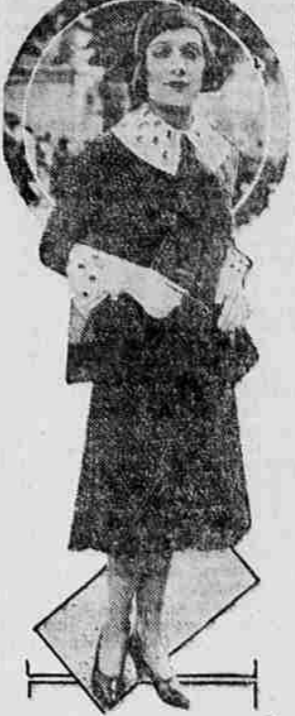
Chiffon is one of the prettiest polka dotted media this summer. A navy blue and white outfit used the blue and white dotted fabric for the little princess frock and the loose jacket, both with pleated ruffles of plain blue edging them. A collar and cuffs of white linen were embroidered in double blue dots and the hat, purse and shoes were navy blue also.