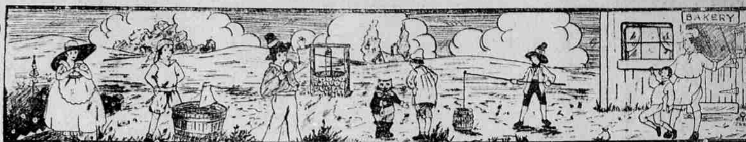
Copyright 1929, by R. E. Corbit Corporation, N. 115 1/2 Wall St., Spokane, Wash.

To be given each week to the boys and girls of the La Grande Evening Observer family. You can earn some money each week by writing prize winning endings for the jingles below. This page will appear each Wednesday. Prize winners will be announced next Wednesday.