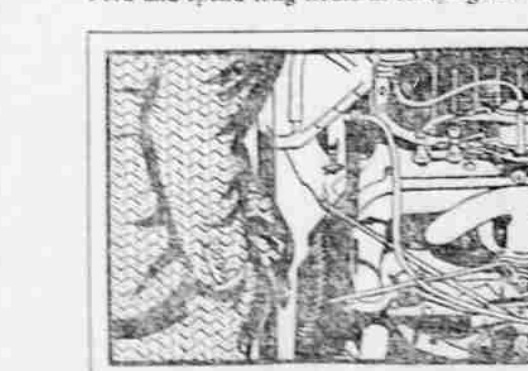
The engine of the new Ford embodies many new mechanical features. Because of its carefully-planned simplicity, it gives unusual acceleration, smoothness, speed and power without sacrifice of economy and reliability.

WHEN you look beneath the hood and study the engine of the new Ford, you will begin to understand how carefully this car is made, and see something, too, of the enduring quality that has been built into every part.