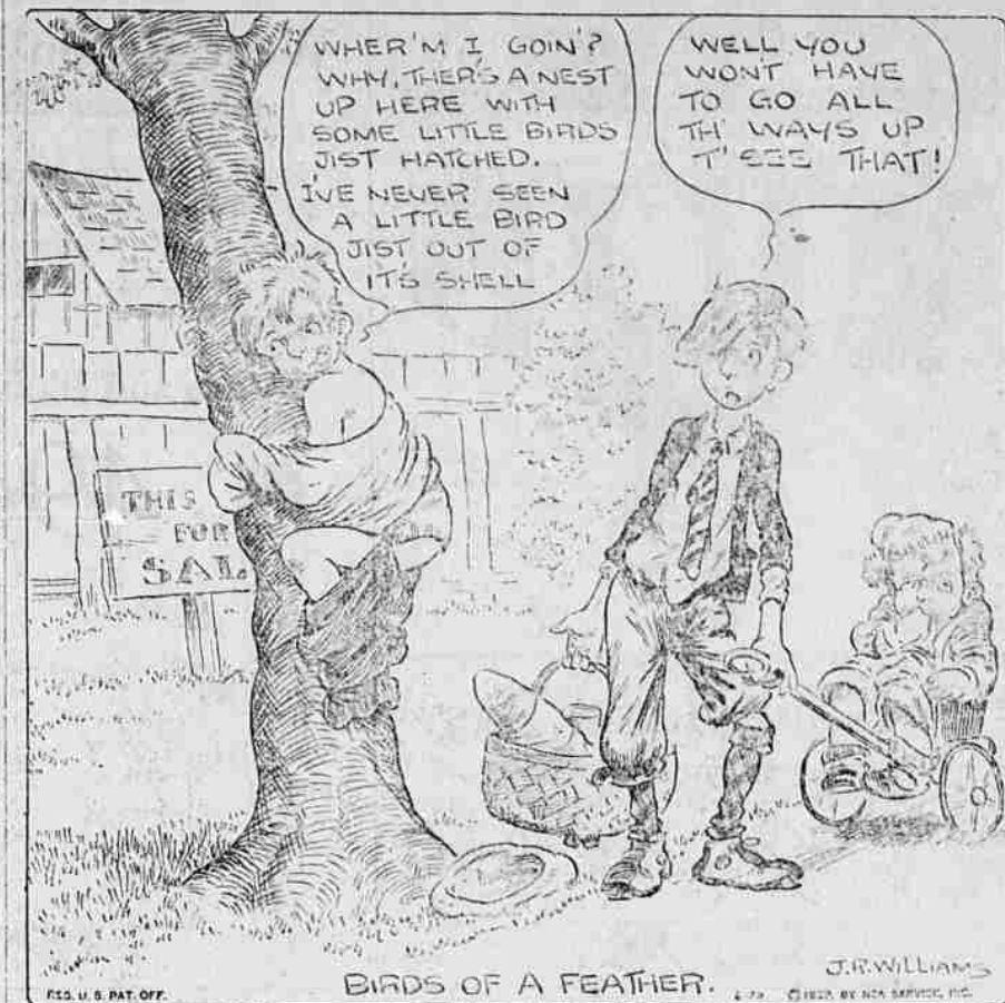
BIRDS OF A FEATHER. J.R. WILLIAMS