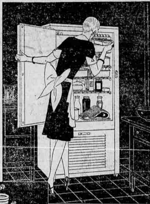
The Kelvinator Cold Keeper for Dainty Frozen Dishes

You can enjoy your Kelvinator immediately. Buy it now on Kelvinator's attractive ReDisCo monthly budget plan. No need to wait.