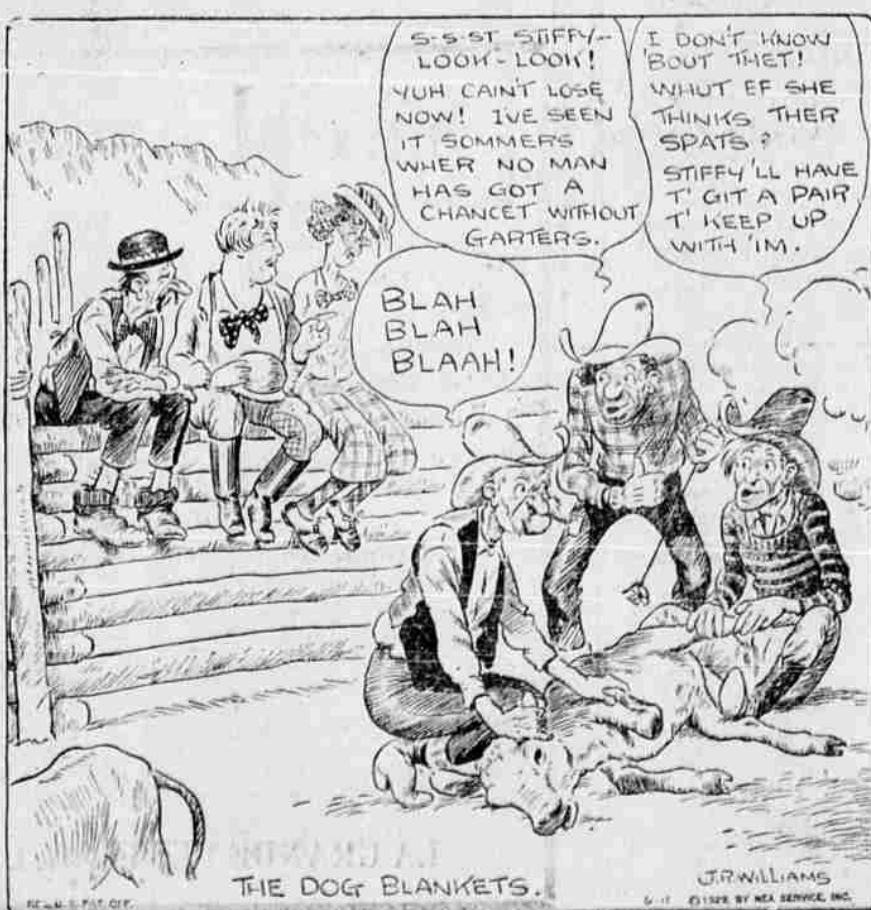
THE DOG BLANKETS.