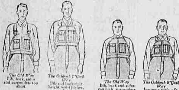
The Old Way Bib, back, and suspenders too short The Oshosh B'Gosh Bib and back just right, waist higher, suspenders longer The Old Way Bib, back and suspenders too long—poor fit The Oshosh B'Gosh Bib and back just right, waist higher, suspenders longer

Whether you are tall or short or in between, Oshkosh B'Gosh overalls will now fit you better than ever. The short man doesn't like his overall bib hitting him under the chin, the back up to his neck and the buckles pulled back over his shoulders. The tall man doesn't like his waistline so low that his shirt works out; suspenders so short that he can't let them out enough and the bib and back way down low. The new Oshkosh B'Gosh "graduated scale of patterns" mean a perfect fit for every figure. If your dealer hasn't the new Shadowweave tailored-to-fit overalls in stock, tell us his name and we will see that you are supplied.