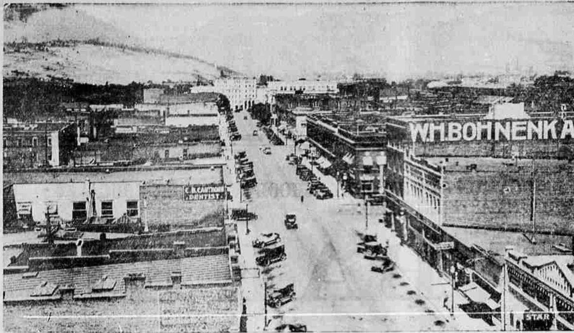
The above picture shows the main business section of La Grande, along Adams avenue from Fir to Fourth streets. The photographer focused his camera from the top of the seven-story Sackajawa Inn. The building at the other end of the street is the La Grande hotel, ornamental street lighting system and the busy appearance of the street. In the background is the mouth of the Grande River canyon and to the left is part of Rooster peak.