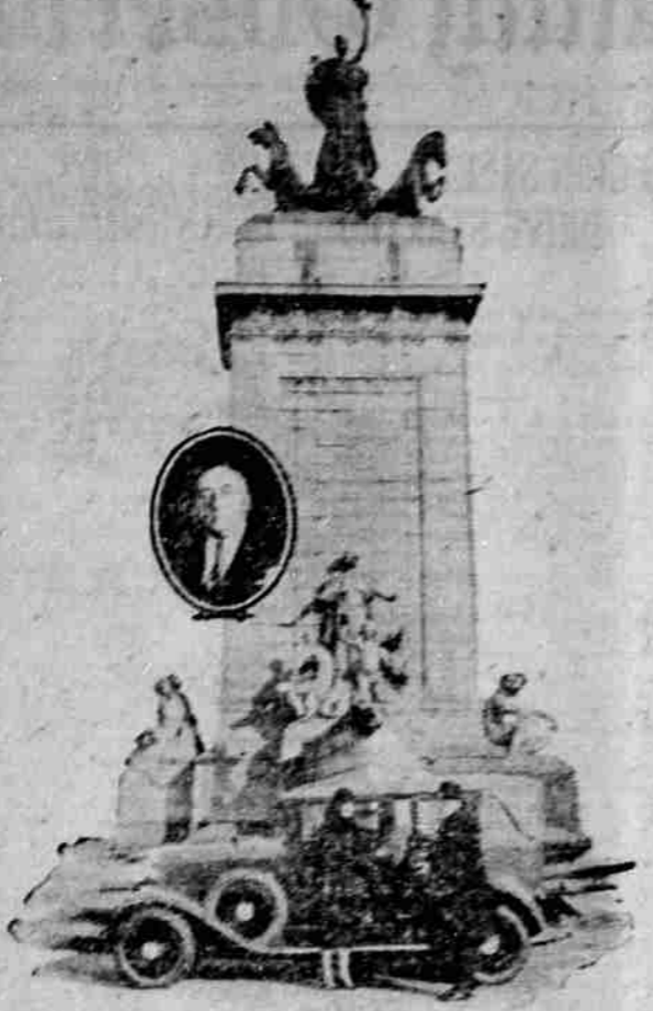
M. Paul Poiret, Parisian stylist, lands American automobiles after taking a drive in his new Oldsmobile landau just prior to shipping it to his home in France. The above picture shows Poiret and his Oldsmobile in front of the U. S. E. Mains memorial in New York City.