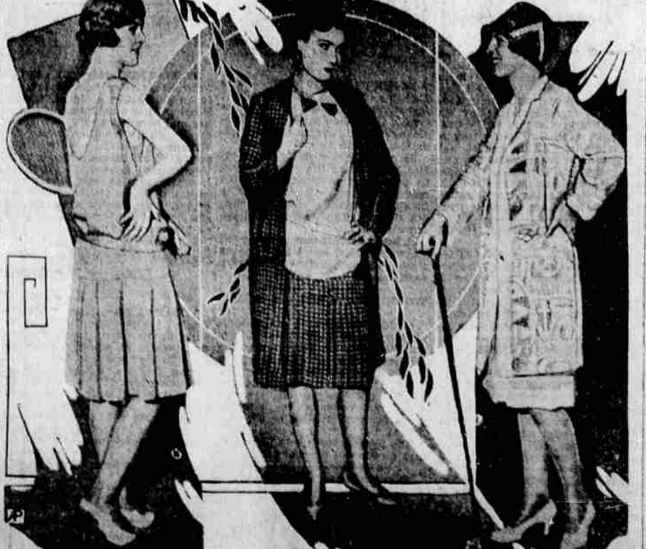
Left: A charming sport silk pique tennis dress with the new cut exposing the back to sun rays. Center: A neat and attractive brown and yellow or pale blue checked ensemble. Right: A light white costume in green and white for the golf course.