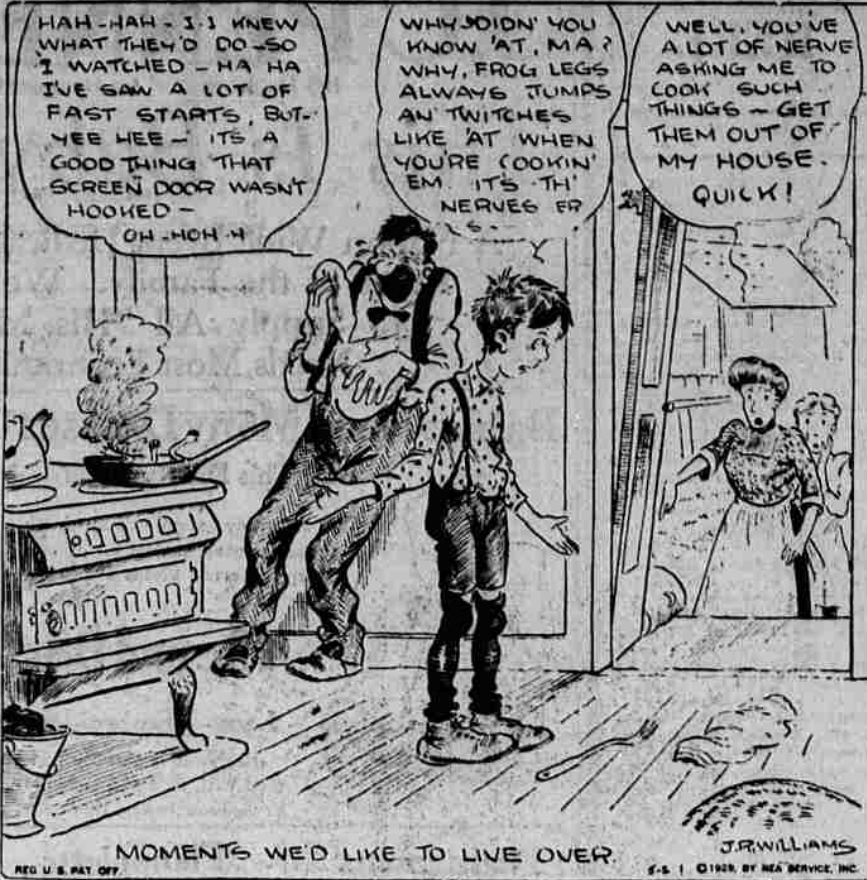
MOMENTS WED LIKE TO LIVE OVER.