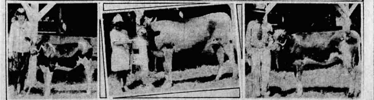
The only reason why there are so many pictures of Cove club members and their prize winning animals, published is because there are so many of them and they are so enthusiastic about their work and their showings.