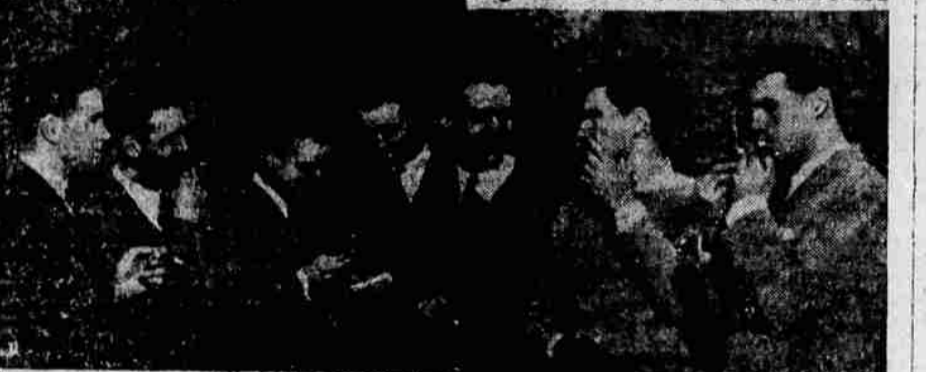
THE WILLIAMS RECORD, TUESDAY, MARCH 26, 1929

But look what happened when a third of the student body compared the four leading cigarettes with names concealed