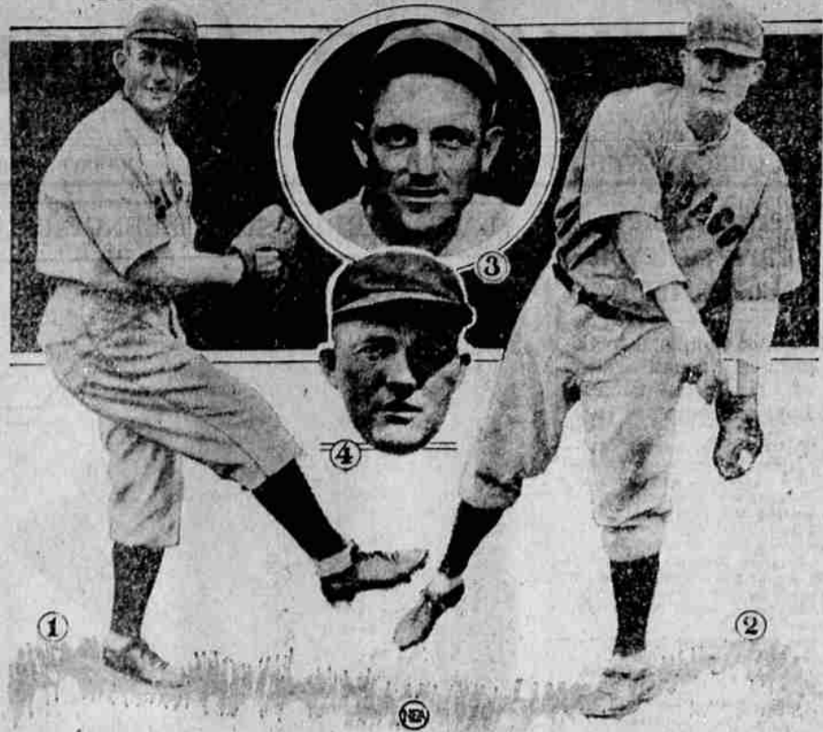
Efficient pitching and the added batting punch supplied by Rogers Hornsby—these are the factors Manager Joe McCarthy thinks his Chicago Cubs will need most to win the pennant this summer. He feels sure Hornsby will drive in enough runs to win a lot of those games that seem lost last summer by one run and he expects Hal Carlson, Art Nehf and Pat Malone to supply the pitching strength needed. If St. Louis deliver, as McCarthy believes they will, it will take a lot of power on the part of some other club to keep them from winning the pennant.