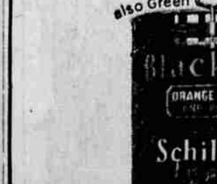
also Green tea (Japan) Black ORANGE PEKOE Schilling

Fresh teal No other is like it + for it's a Schilling secret.