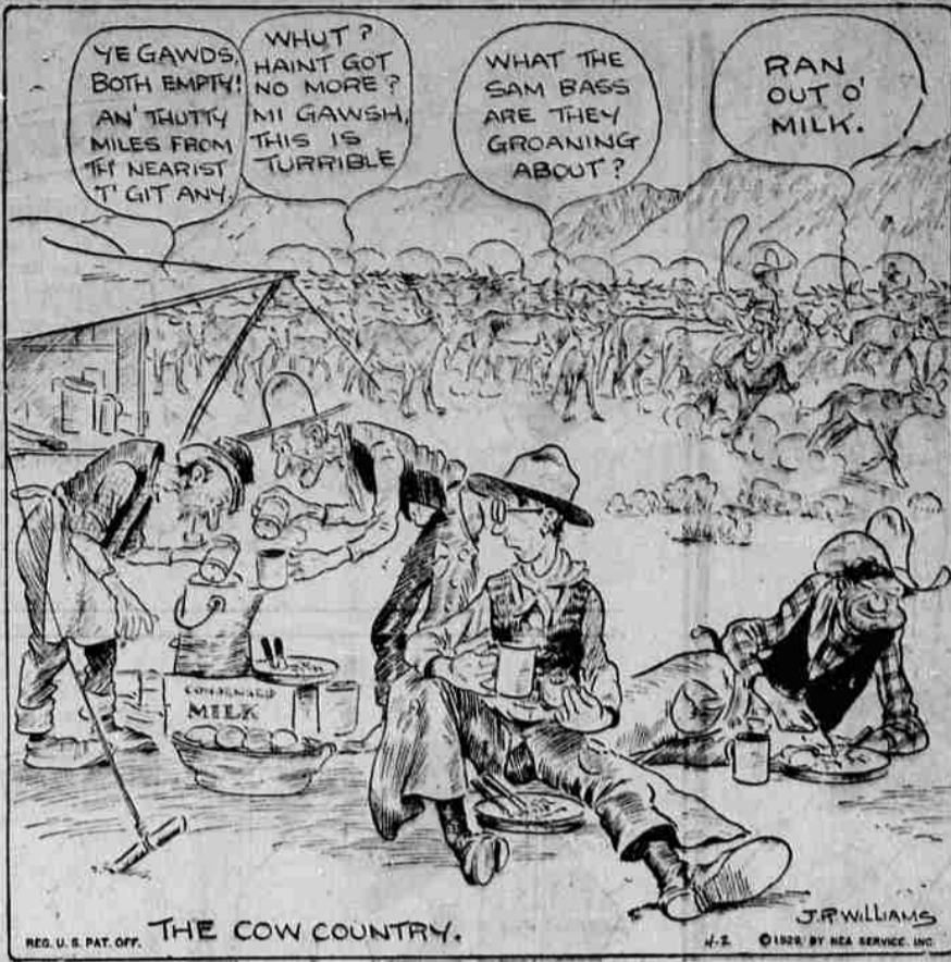
REG. U. S. PAT. OFF. THE COW COUNTRY. J.P. WILLIAMS. U.S. © 1928 BY NEA SERVICE, INC.