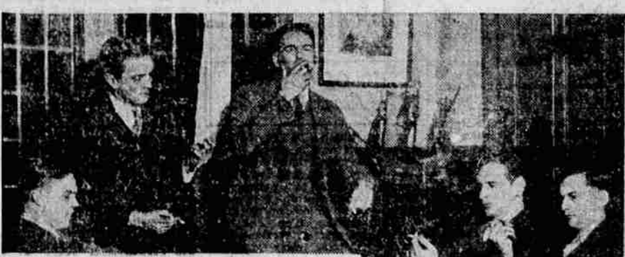
A group of Yale upper-classmen comparing the four leading cigarette brands.