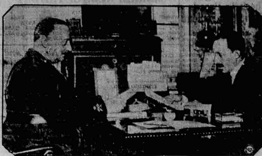
A rare picture is this of a dictator and a king in conference. The dictator is General Primo de Rivera, militant head of the Spanish government, and the king is the quiet-mannered Alfonso. The subject of their meeting is a grim one—they're discussing what punishment should be meted out to the chiefs of the recent revolt which was squelched by authorities.