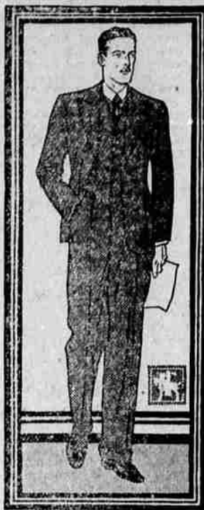
In business it's a 2 or 3 button peaked lapel suit of Malacca tan, Scots grey or Dickens blue.