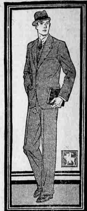
At the universities it's a 2 button suit with lapels rolling to the second button.