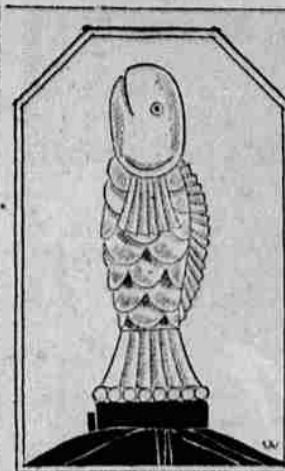
AN UMBRELLA that typifies the modern made has a carved wooden fish for a handle.

The Supreme Forest Woodmen Circle lodge met last night at 7:30