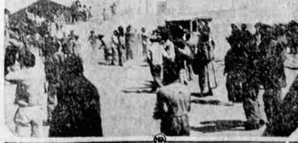
Scenes attendant to the execution of Jose Leon Toral, assassin of President-elect Obregon, at the Mexico City penitentiary are shown.