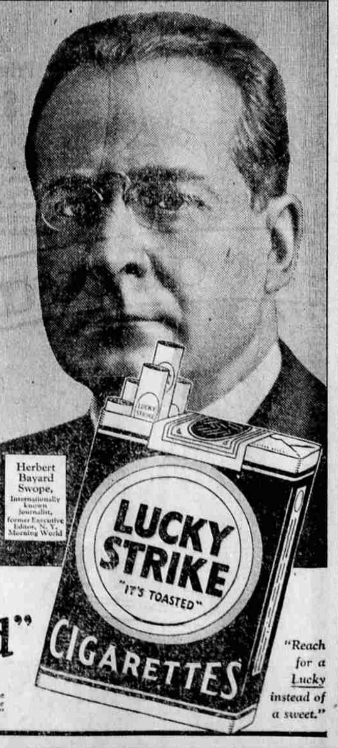
Herbert Bayard Swope, Internationally known journalist, former Executive Editor, N. Y. Morning World

Cost to coast radio hook-up every Saturday night through the National Broadcasting Company's network. The Lucky Strike Dance Orchestra in "The Tunes that made Broadway Broadway."