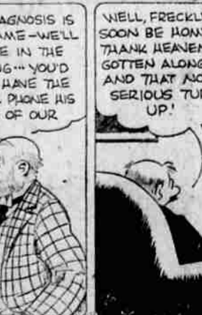
MY DIAGNOSIS IS THE SAME—WE'LL OPERATE IN THE MORNING—YOU'D BETTER HAVE THE HOSPITAL PHONE HIS PARENTS OF OUR DECISION!