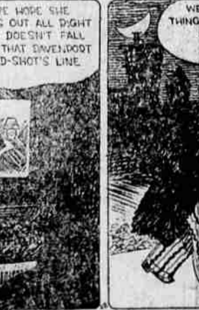
I SURE HOPE SHE COMES OUT ALL RIGHT AND DOESN'T FALL FOR THAT DWEEDY, DODD BEAD-SHOT'S LINE