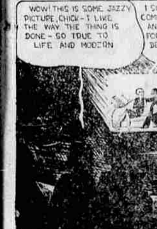
WOW! THIS IS SOME JAZZY PICTURE, CHICK—I LIKE THE WAY THE THING IS DONE—SO TRUE TO LIFE AND MODERN