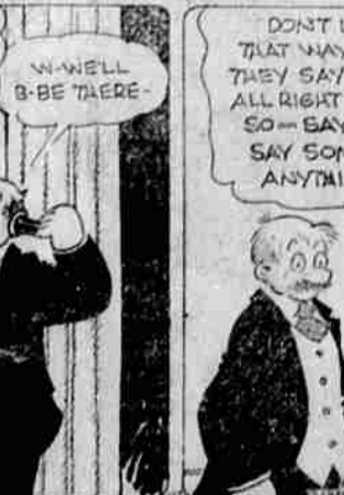
DON'T LOOK AT ME THAT WAY—WHAT DID THEY SAY? IS FRECKLES ALL RIGHT? DON'T STARE SO—SAY SOMETHING—SAY SOMETHING—IS ANYTHING WRONG??