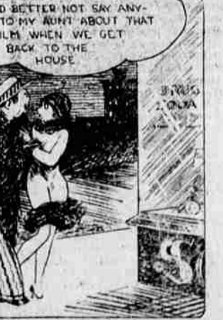
WE'D BETTER NOT SAY ANYTHING TO MY MUM ABOUT THAT FILM WHEN WE GET BACK TO THE HOUSE