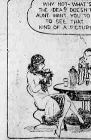
WHY NOT—WHAT'S THE IDEA? DOESN'T YOUR MUM WANT YOU TO GO TO SEE THAT KIND OF A PICTURE?