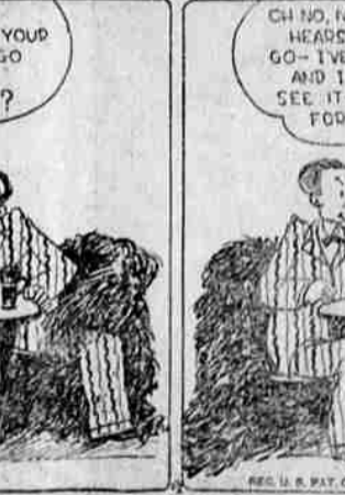
OH NO, NOT THAT, BUT IF SHE HEARS ABOUT IT SHE'LL WANT TO GO—I'VE SEEN IT THREE TIMES AND I DON'T THINK SHE OUGHT TO SEE IT—IT'S TOO ADVANCED FOR HER