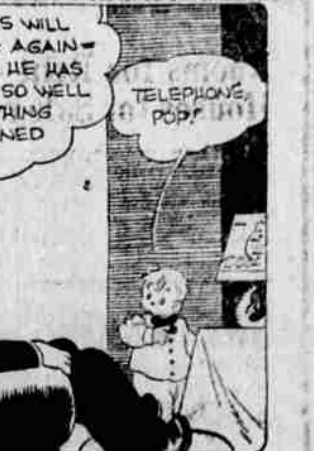
WELL, FRECKLES WILL SOON BE HOME AGAIN—THANK HEAVEN HE HAS GOTTEN ALONG SO WELL AND THAT NOTHING SERIOUS TURNED UP!