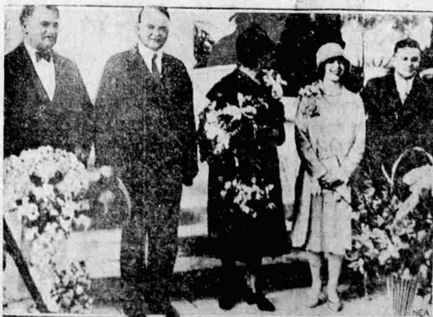
After the long travel strain precipitated by the good will tour of South America, the president-elect and wife are getting their rest and now, as guests of J. C. Penny at Sea Isle, his unique winter home at Miami Beach, Fla. This picture, transmitted by telephone from Atlantic City, to San Francisco is the first view of the Hoover welcome to reach here. Penny is shown at the extreme left, with the Hoovers next to him.