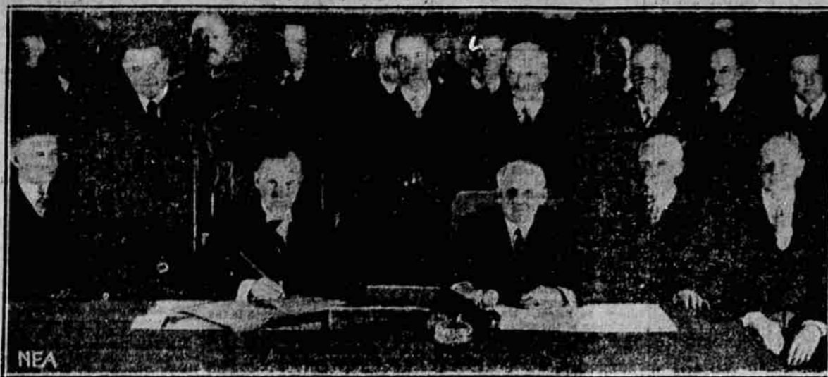
An historic scene that may have a tremendous influence on the future of world peace was enacted in the great East room of the White House when President Coolidge, surrounded by cabinet members and senate notables, signed the senate's acceptance of the Kellogg anti-war treaty, thereby making it a law. In this picture President Coolidge is shown signing the document with the Kellogg pen, presented to the secretary of state by the city of La Hayre, France, seated, from left to right, are Vice President Dawes, President Coolidge, Secretary Kellogg, Secretary Mellon and Secretary of War Davis. Standing are Senator Borah, Senator Swanson, Senator Walsh, Vice President-elect Curtis. President Coolidge is said to regard the Kellogg anti-war treaty as the most important document of his administration.