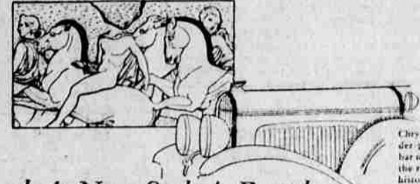
Chrysler's matching of slender grille radiator with cowl bar moulding has its origin in the repetition of motif in the historic frieze of the ancient Parthenon.