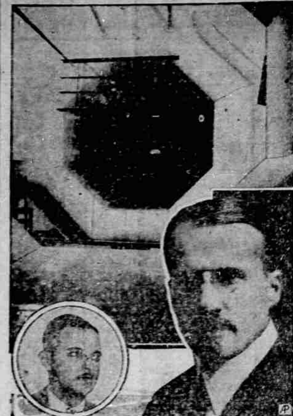
The University of Michigan wind tunnel is ready for research in airplane design.

for almost a month but is reported to be very much improved at this writing.