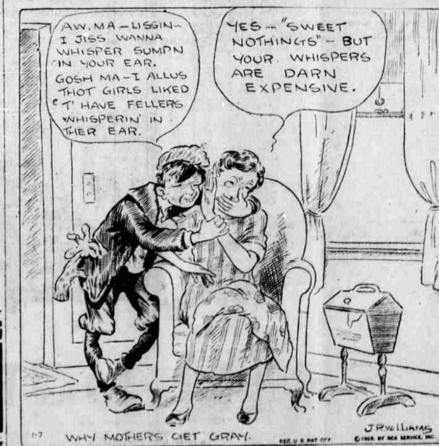
WHY MOTHERS GET GRAY.