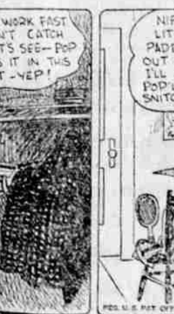
NIFTY! ALL IT NEEDS IS A LITTLE DRUNKING, OR SOME PADDING IN MY SHIRT TO FILL OUT THE SHOULDERS—BABY! I'LL BE DRESSED TO THRILL. POP'LL NEVER GET WISE IF I SNITCH IT JUST ONE NIGHT.