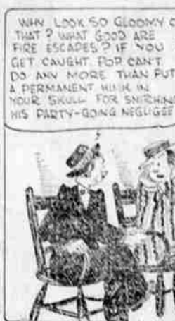
WHY LOOK SO GLOOMY OVER THAT? WHAT GOOD ARE FIRE ESCAPES IF YOU GET CAUGHT FOR CAN'T DO ANY MORE THAN PUT A PERMANENT WINK IN YOUR SKULL FOR SMIRKING HIS PARTY-GOING NEGUEES?