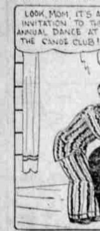
LOOK, MOM, IT'S AN INVITATION TO THE ANNUAL DANCE AT THE CANDLE CLUB!