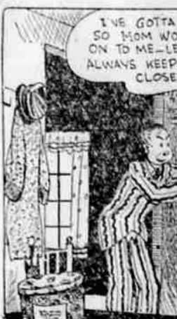
I'VE GOTTA WORK FAST SO MOM WON'T CATCH ON TO ME—LET'S SEE—POP ALWAYS KEEPS IT IN HIS CLOSET—YEP!