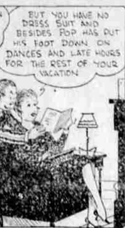
BUT YOU HAVE NO DRESS SUIT AND BESIDES POP HAS PUT HIS FOOT DOWN ON DANCES AND LATE HOURS FOR THE REST OF YOUR VACATION.