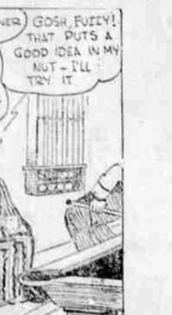
GOSH, FUZZY! THAT PUTS A GOOD IDEA IN MY MIND—I'LL TRY IT!