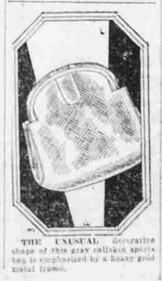
THE UNUSUAL decorative shape of this gray cellulose sports bag is emphasized by a heavy metal frame.

ROSEBURG, Ore., Dec. 11 (AP)—The question of erection of a highway, was before the state highway commission at a special session of the North Oregon highway commission today.