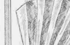
GOLD LANE fashions the newest and smartest fash for the coming season.